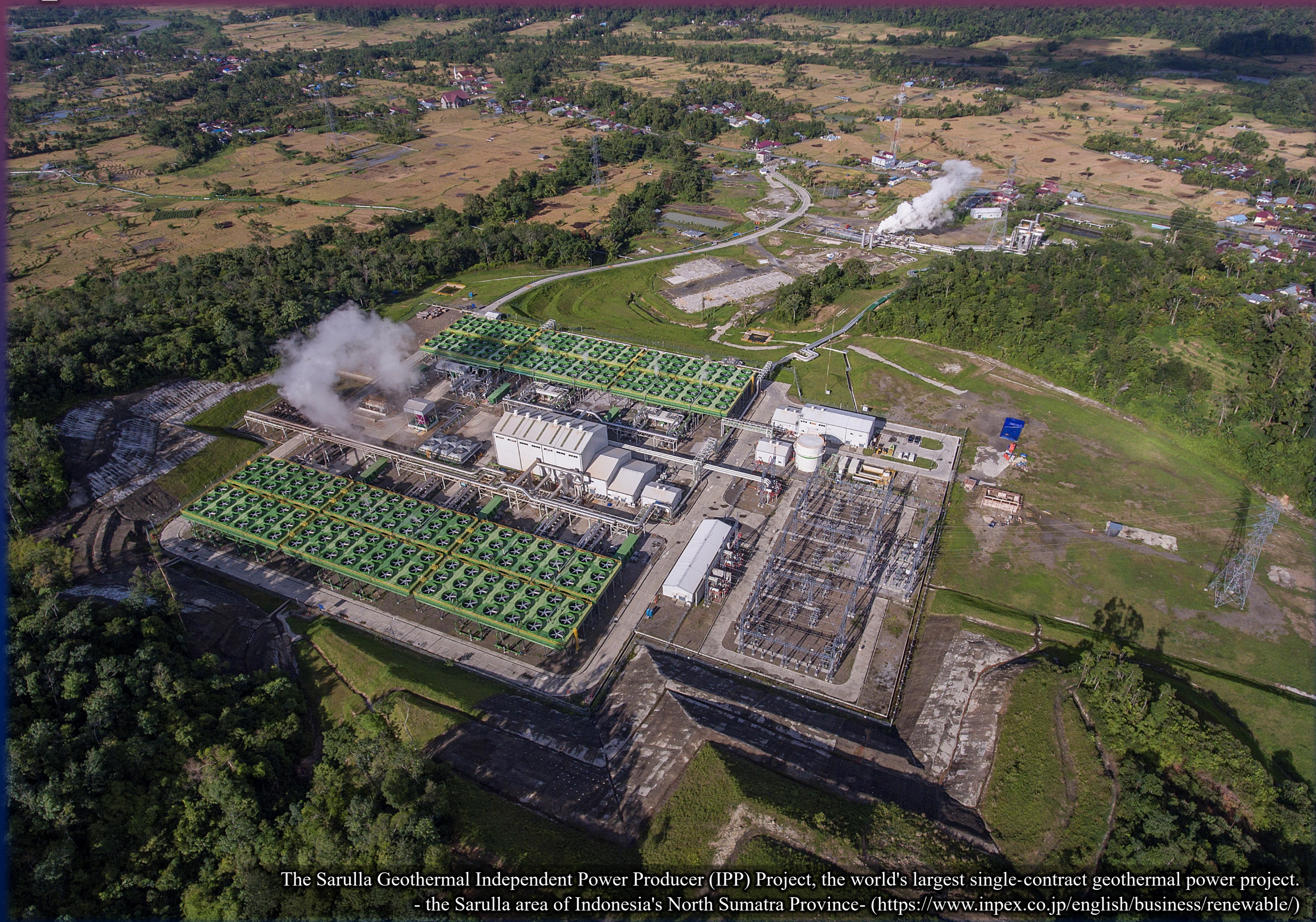
The Sarulla Geothermal Independent Power Producer (IPP) Project, the world's largest single-contract geothermal power project. - the Sarulla area of Indonesia's North Sumatra Province- ( https://www.inpex.co.jp/english/business/renewable/ )